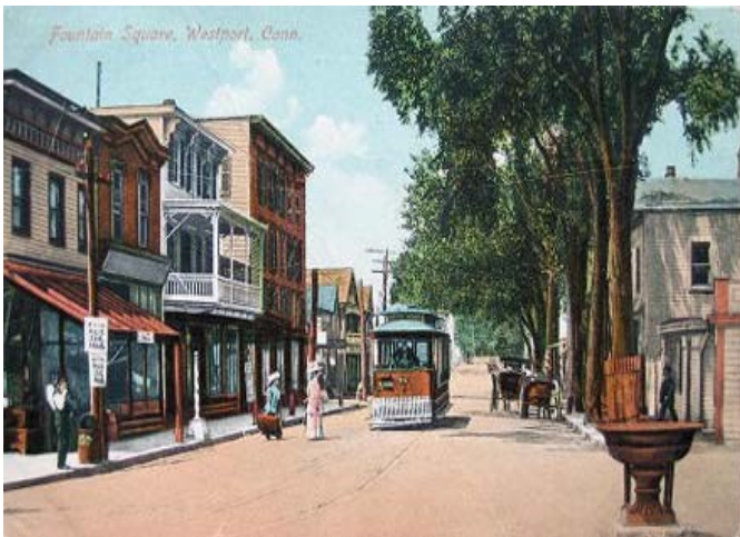
Postcard of Main Street 1913

Although colonists settled along the Saugatuck River in 1639, Westport was officially incorporated as a town in 1835 with land taken from Fairfield, Weston and Norwalk. For several decades after that, Westport was a prosperous agricultural community, which distinguished itself as the nation's leading onion-growing center. Westport's Compo Beach was the site of a British expeditionary force's landing, in which about 2,000 British soldiers marched to Danbury and razed it, resulting in the Battle of Ridgefield. They were attacked on the way and attacked upon landing by Minutemen from Westport and the surrounding areas. A statue of a Minuteman, rifle in hand, is located near Compo Beach.