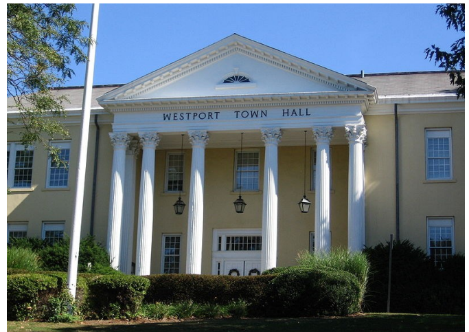
Westport Town Hall