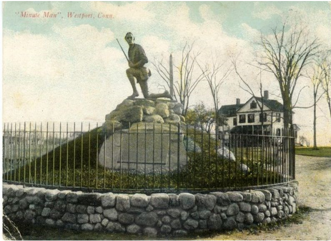
Minute Man at Compo Beach 1912